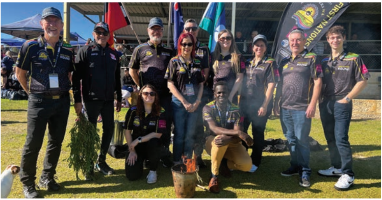
Clockwise from top: Canning Vale Senior Football Club – PRIDE Round, AFL Master cheque presentation, ASouthern River P&C (Drama Program), EDO Nigeria Association of WA, AFL Masters First Nations Round.