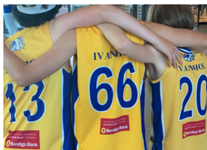
The Ivanhoe Knights kids enjoying being back together after the long COVID break.