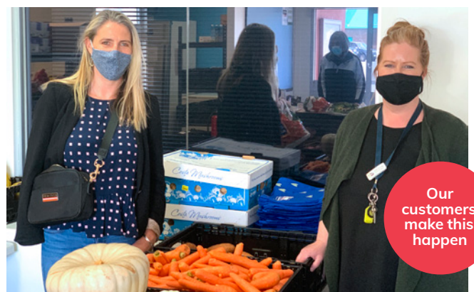
We're proud to support BANSIC's new Food Hub on Oriel Road.