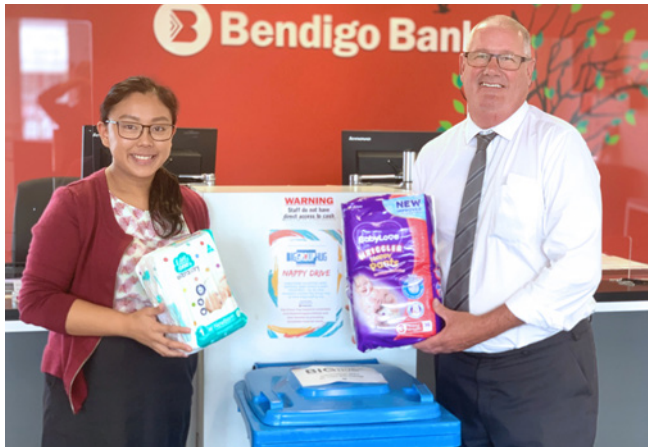
Our branches are drop-off points for nappies and toiletries for Big Group Hug.