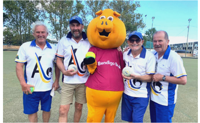
Congratulations to the members of Alphington Bowls Club who are celebrating 100 years of bowling.