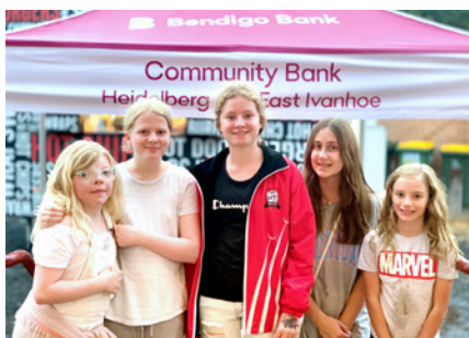
Young players at Parkside Netball Club in front of their new marquee.