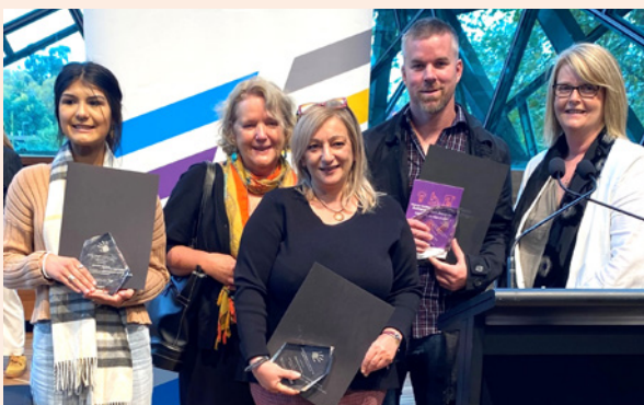
Recognising the teachers who have supported their students in Youth Foundation community projects.

bchs.org.au/services/kids-youth-and-families/youth-foundation-3081