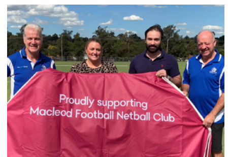
It's great to continue our support of the Macleod Football Netball Club this season.