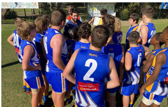
Great to see the kids at Macleod Junior Football Club back on the field.