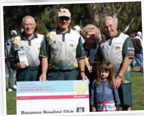
Our sponsorship of bowling clubs continues, including the Rosanna Bowling Club.