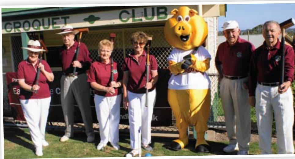
The Ivanhoe Park Croquet Club celebrates its centenary in 2013.

One of the oldest clubs in the region, the Ivanhoe Park Croquet Club celebrates its centenary this year. The milestone has been marked by a series of events over the course of the year, culminating in their centenary lunch at Latrobe Golf Club in November. We have been proud to support this club over many years and congratulate them on their achievement.