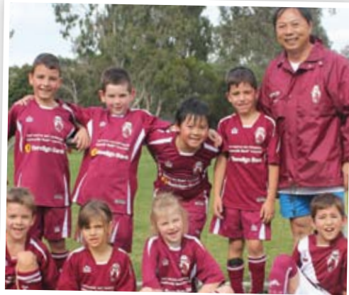
Banyule City Soccer Club junior players.