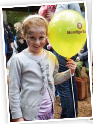
Kinder kids celebrate 50 years at Macleod Preschool.