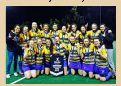
The YVHC U16 Girls Pennant Champions.

Congratulations to their premiership teams - Mens Pennant F, successful in their grand final against La Trobe 3-0 and to the Women Vic League 1 winners in their grand final a whopping 5-1. The Under 16 Girls Pennant Team also took top honours winning the Grand Final.