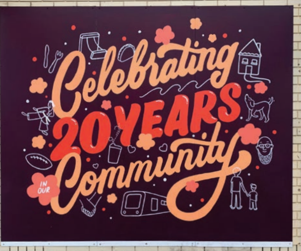
Top: Moorabbin Bowls Club mural. Above left: Scarborough Playground, Bluff Road. Above right: Our 20th Birthday Mural at Community Bank Highett.

It is hard to believe we are halfway through the year. With the setbacks and challenges we have all faced, lockdowns and restrictions, the year has flown by very quickly. Whilst it has been a challenging year for our local organisations and many small businesses, we continue to be here for you.