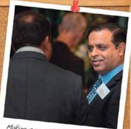
Making connections at our recent Networking Evening.