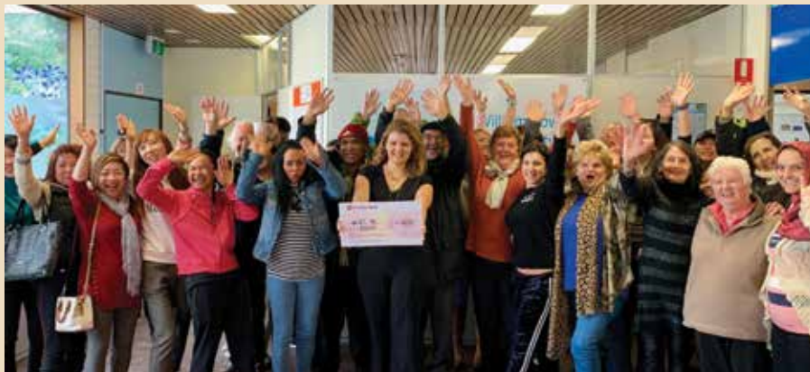
Williamstown Community and Education Centre.