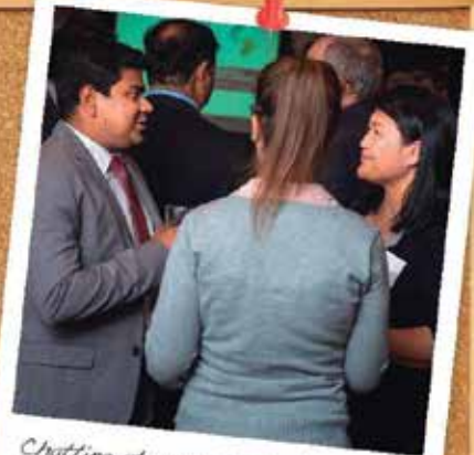
Chatting at our recent Networking Event.