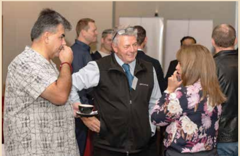
Business Evening Networking Event.

Finally, thanks to those who took the time to join us. We hope you enjoyed yourselves and that you feel a little more connected, a lot more informed and ready to 'be part of something bigger!'