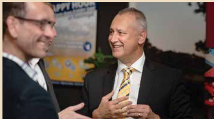
Meeting our business community.