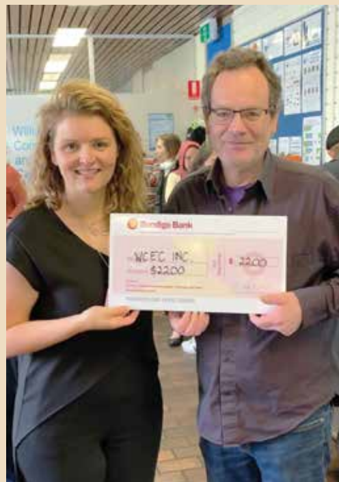
Above: WCEC receiving their Community Grant funding.