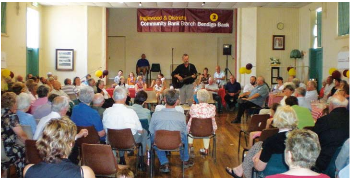
Shareholders Luncheon held Sunday 17 February 2008.