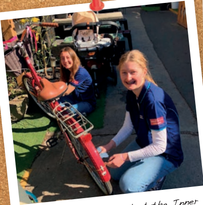
The team helping out at the Inner West Community Bike Hub launch

MAD Youth have been busy supporting the local community including volunteering at the opening of the Community Bike Hub and donating $300 to the West Footscray FC All Aboard Fund which helps children in need get out on the football field.