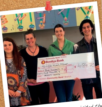
Students from the college visited the WFNH's Saturday morning program

Footscray City College Students Give Back