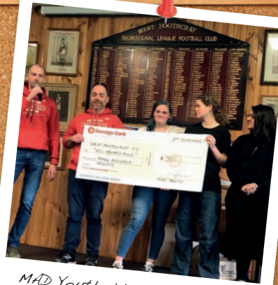
MAD Youth giving back to West Footscray Football Club

MAD Youth have been busy supporting the local community including volunteering at the opening of the Community Bike Hub and donating $300 to the West Footscray FC All Aboard Fund which helps children in need get out on the football field.