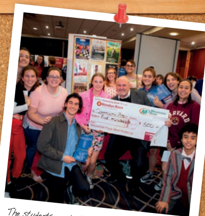
The students received $1650 from Community Pitch earlier this year to support their annual school musical

After participating in Community Pitch 2019, year 11 theatre studies students were keen to give back and decided to donate the proceeds of their recent theatre studies performance to West Footscray Neighbourhood House's Single Mums Program