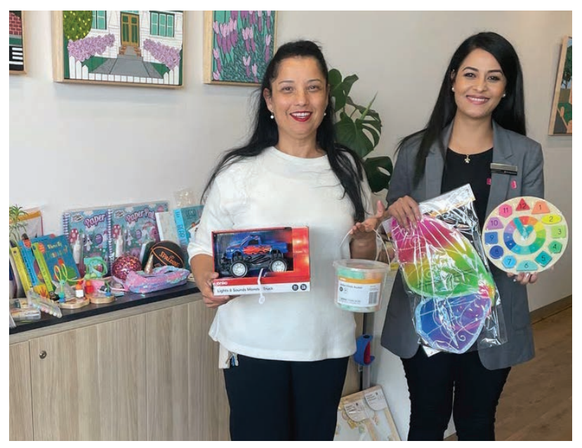
Supporting Yarraville Special Developmental School with a toy drive.