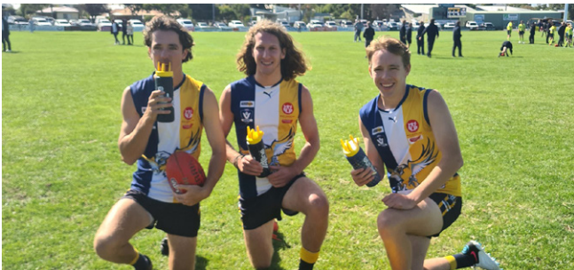
Above: We are delighted to support Inverloch-Kongwak Football Netball Club, helping them purchase new water bottles for players.