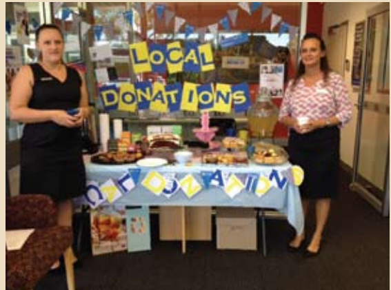
Branch Staff supporting the Biggest Morning Tea.