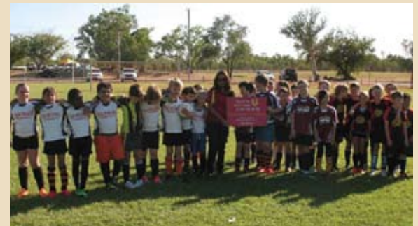
Clockwise from top: Presenting Netballs; Soccer Action and Presenting Soccer Balls; Presenting You Mob Uniforms and You Mob Action Photo; Chamber of Commerce Golf Day.