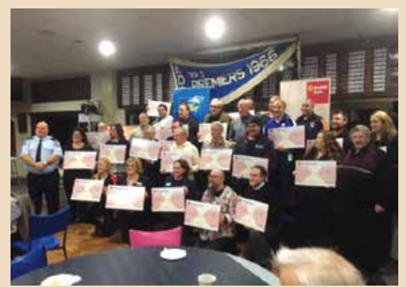
2016 Grant Night group.

This year four grants were given to FTG Eagles Junior Football Club Knox Historical society, the Mens Gully shed and the Upper FTG CFA for defibrillators. Defibrillators are life saving devices that can be used by anyone in the event of a cardiac arrest.