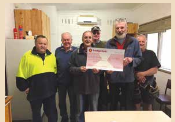
Gully Mens Shed received a grant of $2,250 for a defib.