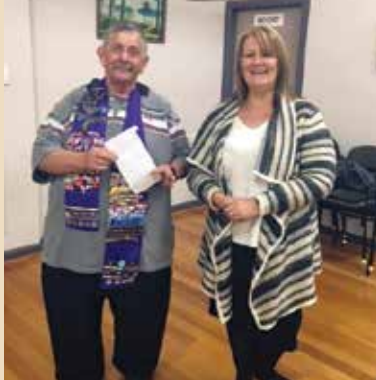
The Gully Town Club.