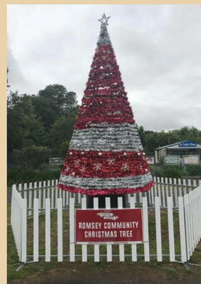
Bendigo Bank Christmas in Romsey 2017 kicked off with the decorating of the Romsey Community Christmas Tree. We are a proud major sponsor of this festival – an initiative of the Romsey Region Business & Tourism Association (RRBATA).

Lancefield & Romsey Community Financial Services Limited 20A High Street, Lancefield VIC 3435 ABN 44 093 517 714