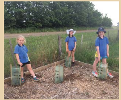
Junior Landcarers – local Girl Guides and the 'Green Team' at Lancefield Primary School enjoying planting and tending gardens with members of the Deep Creek Landcare Group.