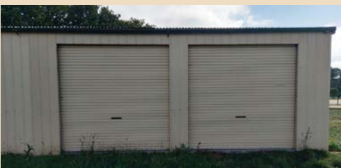
New doors have helped to make the LEG Club Rooms more comfortable and functional.