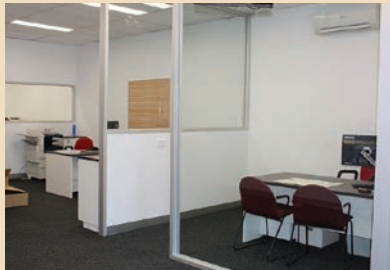
The new open plan layout of the Lancefield Community Bank® Branch.