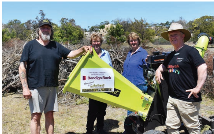
Mount Rothwell Landcare Volunteers: Wood Chipper