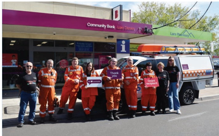
SES: 4WD Vehicle