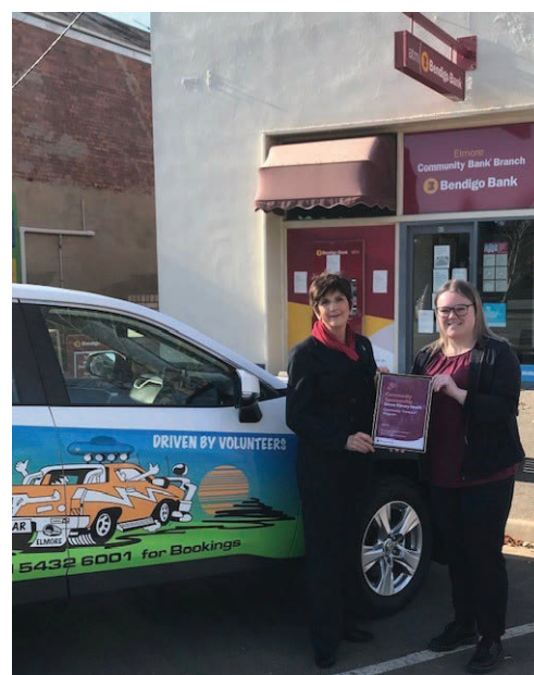
Presentations were made to Bamawm Golf Club, Strathallan Landcare and Elmore Primary Health Care as part of our Community Sponsorship Program.