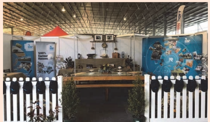
Above - Our 2019 stall (joint with Rural Bank)