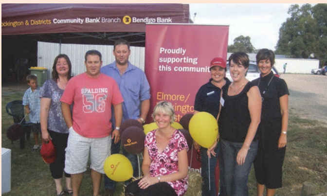
Above - Our team at the Elmore Field Days in 2010