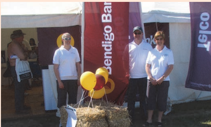
Above - Our team at the Elmore Field Days in 2006