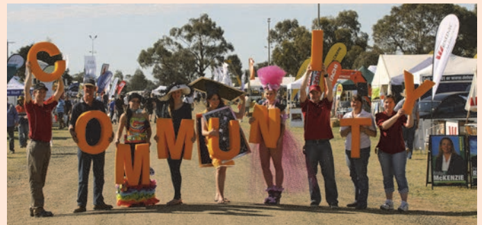
Above - celebrating 'Community' at the 2013 EFD