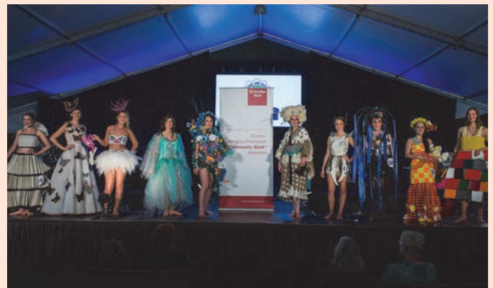
Above - the 2014 Ag Art Parade