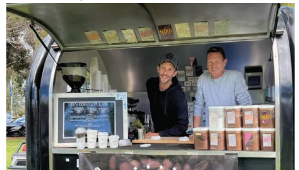
Supporting our flood-affected locals & volunteers with free coffees!