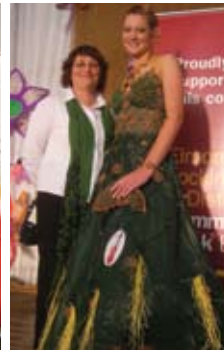
▲ 'Rings All Around'.