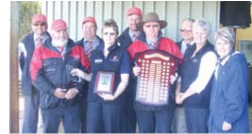
▲ Life Governors Award winner, Lely.

We are sure the 2009 Elmore Field Days was a successful event for all involved and look forward to participating in the 2010 Field Days.