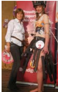
▲ 'Fancy Fencing'.

We were also pleased to continue to support the national competition by awarding the runner up in each of the following national sections – avant-garde, designer and under 21 a cheque for $150. This money provides assistance for the recipient to further their studies in the art and textile area in relation to their creative work.