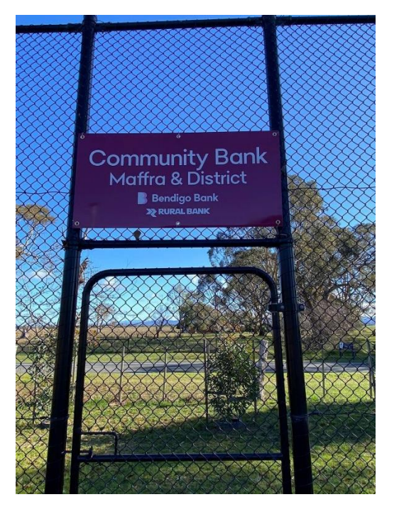
Briagolong Tennis Club

Maffra Municipal Band Stratford Bowls Club Maffra Mens Shed Maffra Golf Club Maffra Cricket Club Maffra Basketball Assoc Maffra Business & Tourism Maffra Secondary Collage Maffra Ag Society Maffra Football Netball Club East Gippsland Veterans Golf Boisdale Briagolong FNC Maffra Rotary Maffra Secondary College Briagolong Community House Quarry Reserve Boisdale Tai Chi