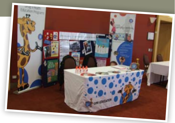
▲ Life Education kit at the Manningham Safety Expo.

Applications closed in mid April and a presentation of cheques will be made mid-year.