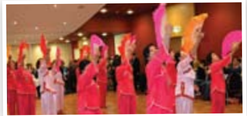
Colourful cultural dancers performed exquisitely.

Our branches were given excellent recognition of the outstanding support we are providing to the local community.