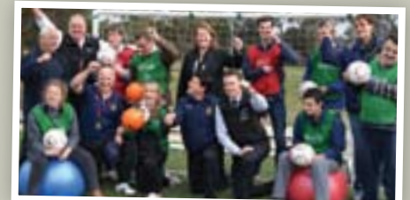
It's a goal for the Onemda team in their soccer clinic.