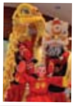
The Lion Dance was vivacious.