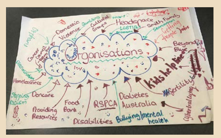
Above: Students brainstormed issues within their community and explored the services that provide support.

One group of motivated young people have created a "Templestowe College Breakfast Club", and plan to offer students, teachers and families breakfast once a week. Their rationale? To ensure kids aren't going to class hungry and unable to concentrate. The Club also builds a stronger sense of community with a communal breakfast. The students will create a roster to run the breakfast, gaining skills in food handling, staffing, set up and pack up, and also human resources.