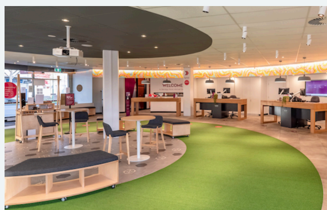
Left and above: Bendigo Bank's branch in Mitchell Street, Bendigo, which our Doncaster East fit-out has been inspired by.