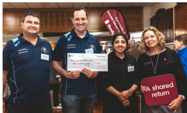
The team from the East Doncaster Cricket Club received a grant for their No Boundaries All Abilities Cricket program