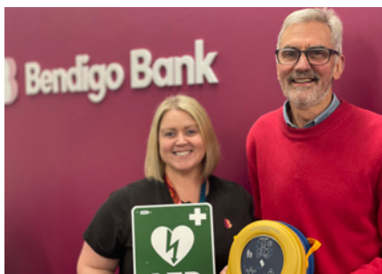
A new defib unit will be installed at Templestowe Reserve to keep local people safe

We recently donated a new life-saving defib to be housed at Templestowe Reserve – home to eight community groups including the Templestowe Cricket Club, Templestowe Junior and senior football clubs.