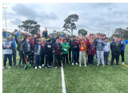
All abilities program participants at MUFC