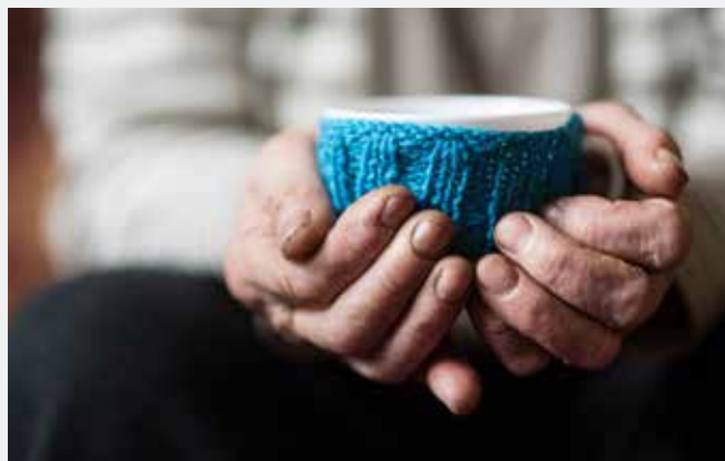
Helping everyone stay warm this winter

As the weather cools down, the heating bills go up. Whilst many people turn their heaters on without a second thought, there is a group of elderly and vulnerable people in Manningham who, due to