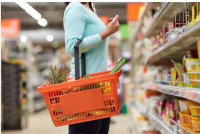
Vouchers will help Doncare's clients get the provisions they need

With the temporary closure of the Doncare Op-Shop network came a loss of revenue for this important organisation who care for our most vulnerable in Manningham. We recently donated $10,000 in supermarket vouchers for Doncare to distribute to those needing emergency assistance.