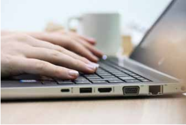
Pines Learning now have ten new laptops for their students to use