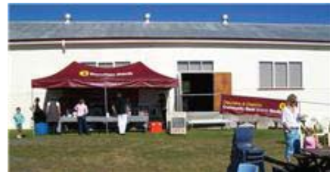
▲ Meander Primary School 125 yr Celebration.

Spread the word on how your banking is changing your local community in big ways!