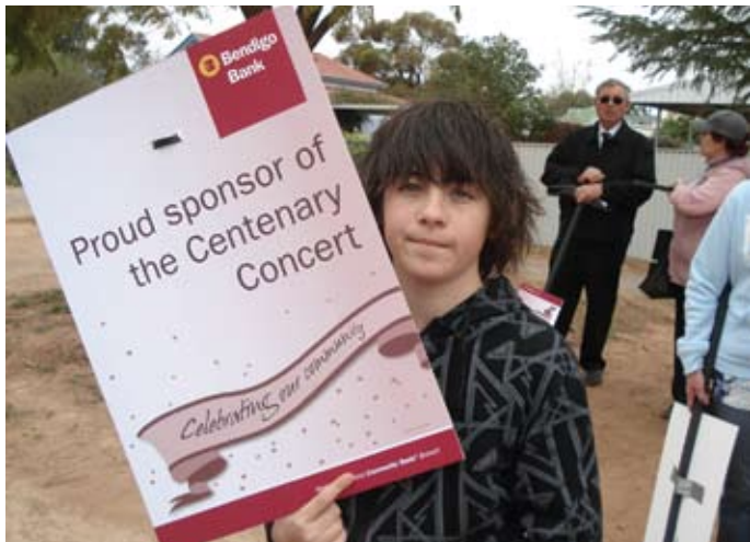
▲ Getting ready for the Parade.