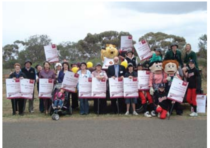
▲ Merbein Community Bank® Branch Float Participants made up of Grant Recipients, Board Members and Branch Staff.