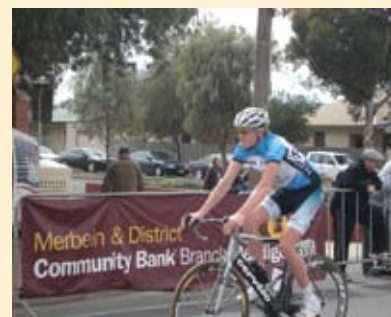
▲ Action from the 14th Tour of the Murray Bike Race held in Merbein on 5 September 2009.