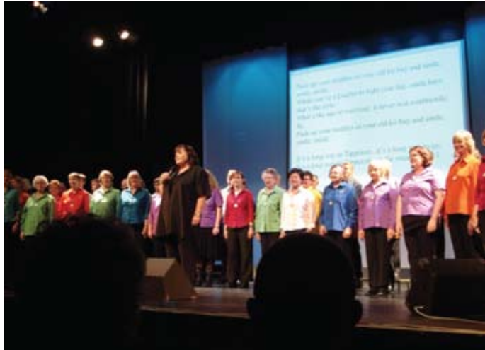
▲ Action from the Centenary Concert.

Grant recipients notified: At AGM, late November 2009