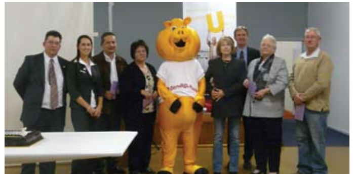
▲ Grant Recipients with their cheques.