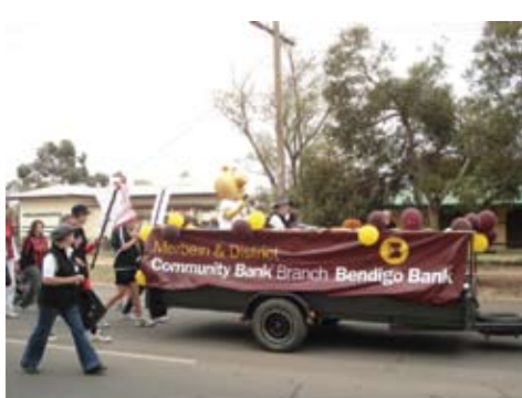
▲ Merbein Community Bank® Branch Float in the Street Parade.