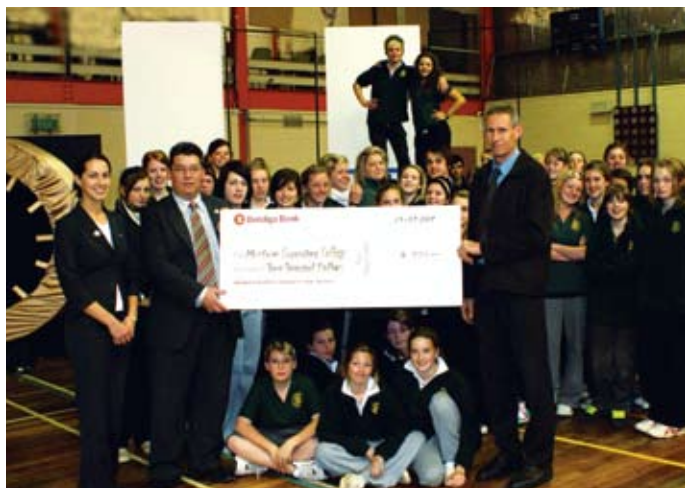
▲ Merbein Secondary College receive their cheque.