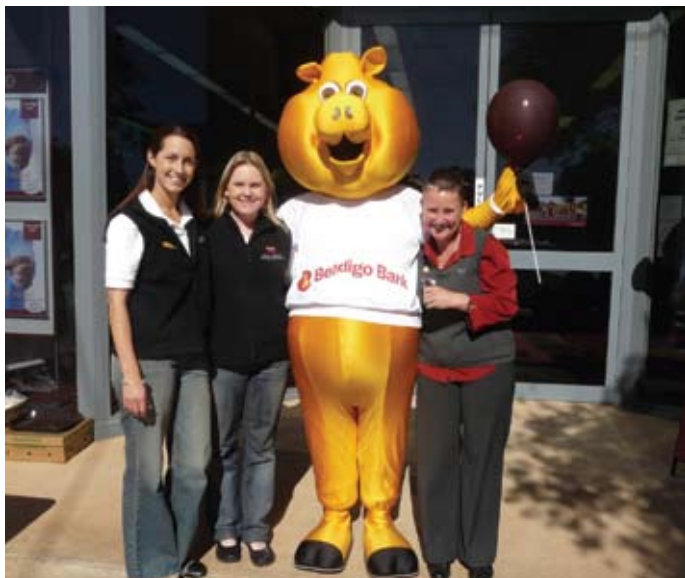
▲ Happy Birthday Merbein Community Bank ® Branch.

The Merbein & District Community Bank ® Branch has now contributed a total of $58,260.65 back to our community through its Grants program since it opened it's doors in 2004. A further $18,430.00 is being held for future pledges.”