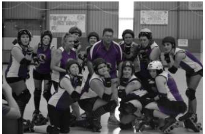
Mildura Roller Derby League