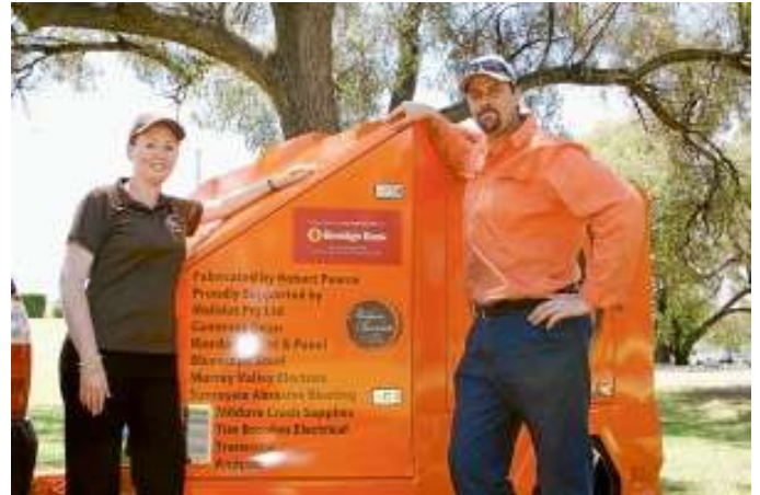
Northern Mallee Sports Star Awards