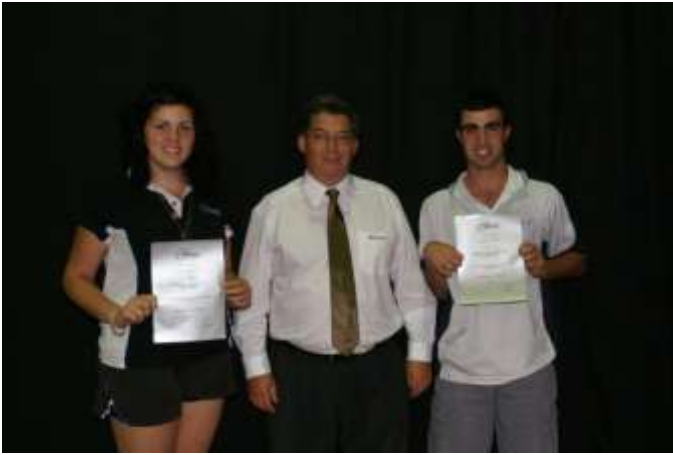
Merbein P-10 College – Future Leaders Award