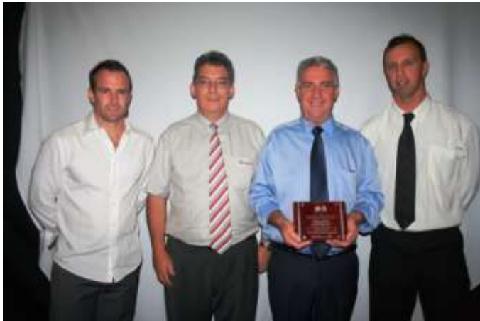
Sunraysia Community Health Services