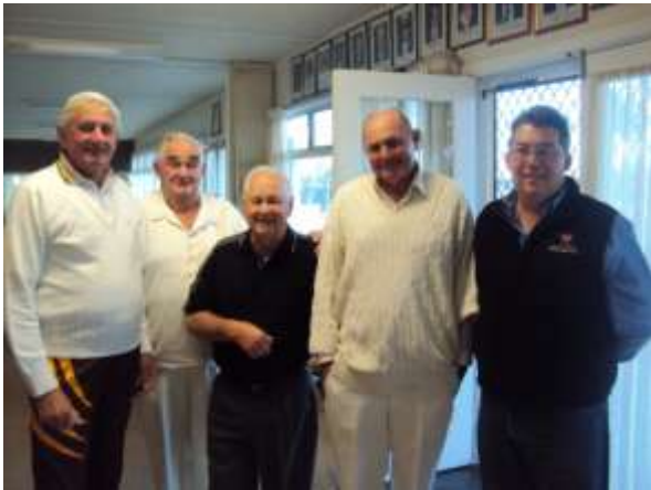
Merbein Bowls Club