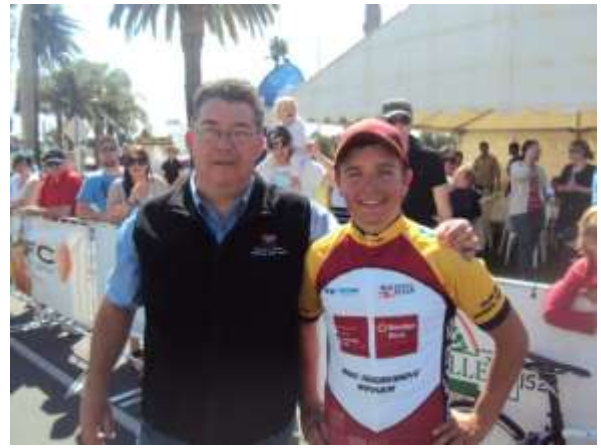
2011 Tour of the Murray Bicycle Race