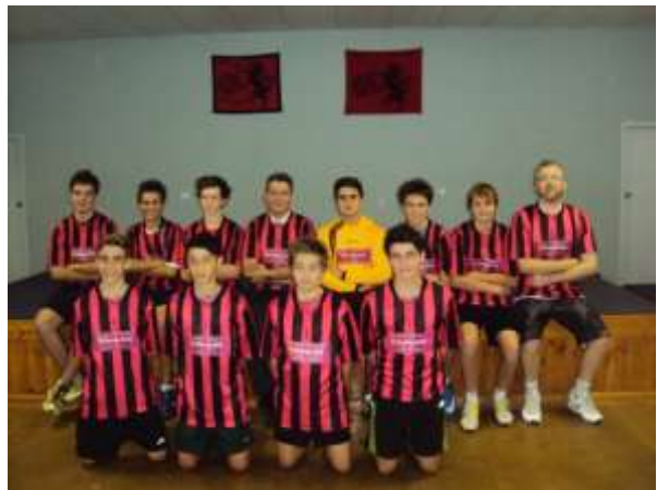
Mildura City Soccer Club