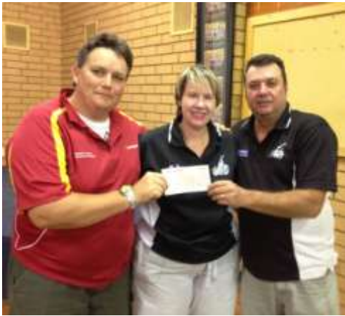
Merbein Football / Netball Club