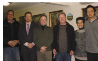
Curtin Community Bank® Project PO Box 321, Curtin ACT 2605 www.wodencb.com.au