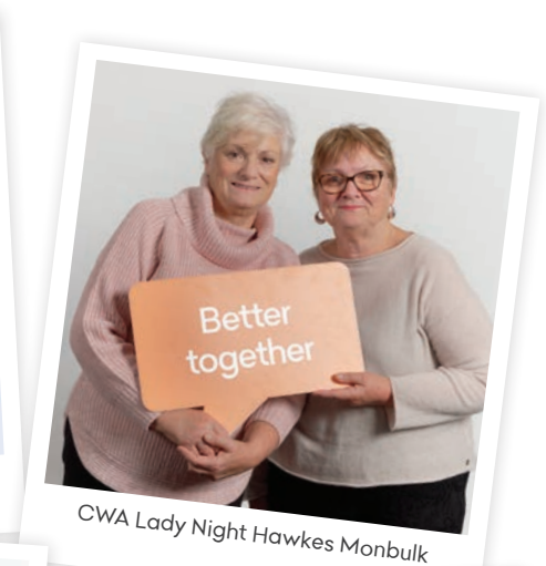
CWA Lady Night Hawkes Monbulk