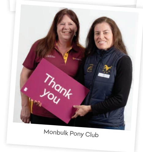
Monbulk Pony Club