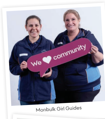
Monbulk Girl Guides