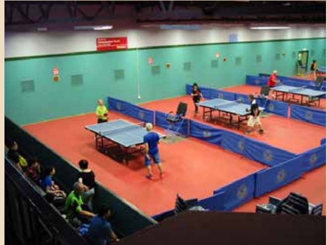
A snapshot of some of the tables.