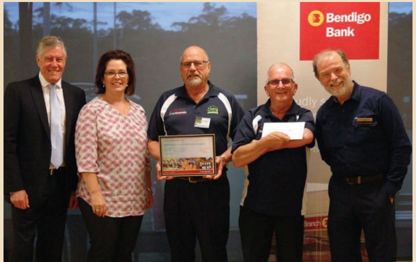
Grant presentation for the Mooroolbark Men's Shed.

The demand for their services has grown so rapidly they recently had to move into larger premises.