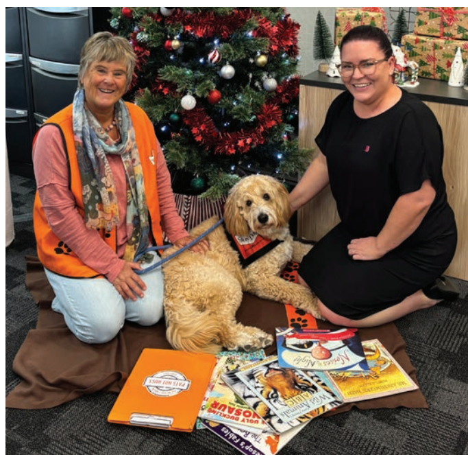
From top: Mornington Yacht Club Season Opener. Moorooduc CFA Fundraiser. Fusion Gala Dinner. Story dogs visit in branch.