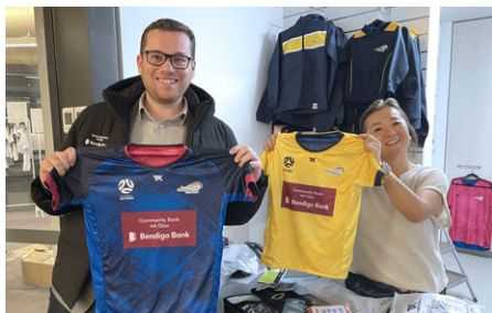
Peninsula Strikers Junior Soccer Club