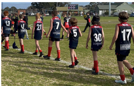
Mt Eliza Junior Football Club