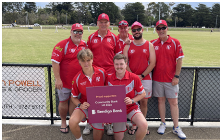
Baden Powell Cricket Club