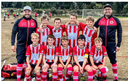
Mt Eliza Soccer Club