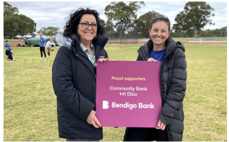
Frankston Little Athletics Club