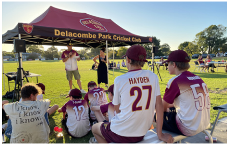
Delacombe Park Cricket Club