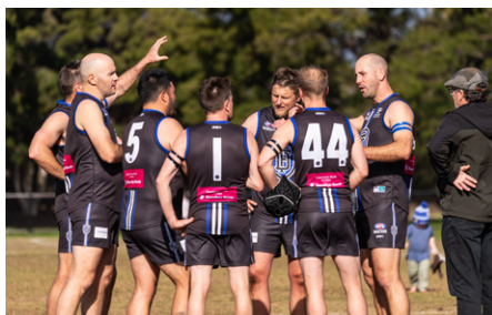
Frankston District Tigersharks