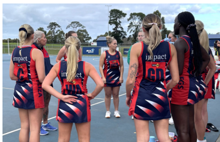
Mt Eliza Football Netball Club