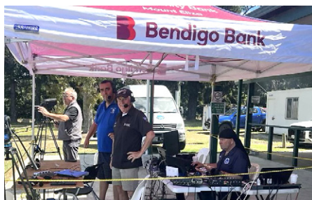
The voice of the peninsula—community radio and broadcaster RPP FM

Derinya Art and Craft Exhibition Frankston Business Collective Lions Club Regional Conference Mt Eliza Art & Design Show Mt Eliza Chamber of Commerce events Mt Eliza Farmers' Market Peninsula Art Society PLOS Musical Productions Probus Central Mt Eliza Rotary Mt Eliza RPP FM WomenConnect Frankston