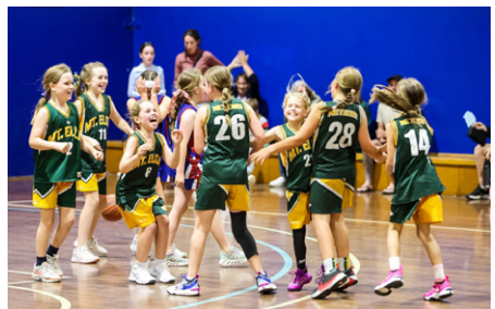
Mt Eliza Meteors