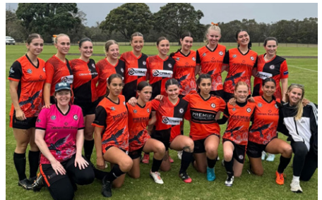
Mornington Soccer Club