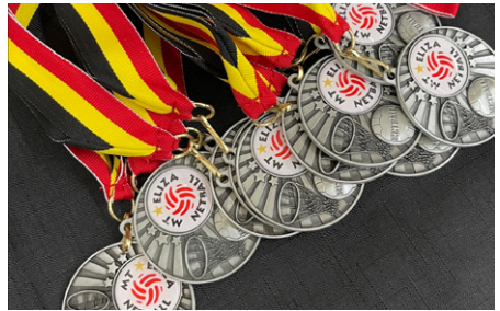
Mt Eliza Netball Club