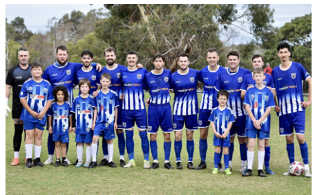
Baxter Soccer Club