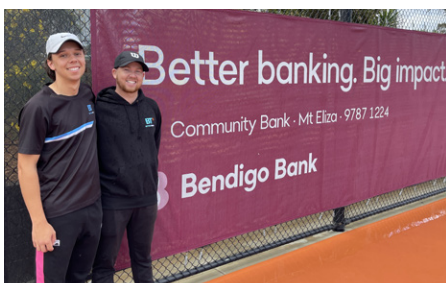
Mt Eliza Tennis Club