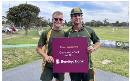
Mt Eliza Cricket Club