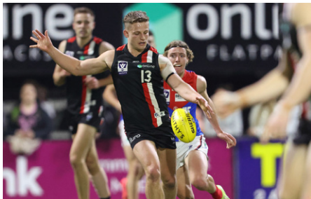
Frankston Football Club