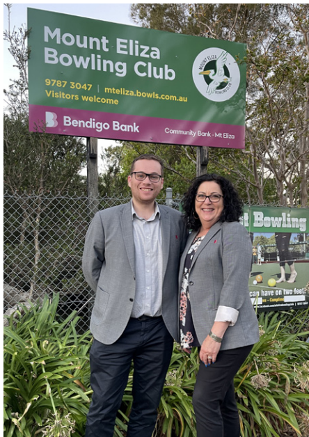
Mt Eliza Bowling Club