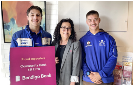
Old Peninsula Football Club