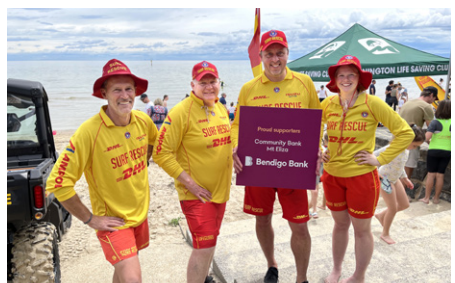
Mornington Life Saving Club