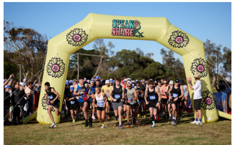
Speak & Share Fun Run