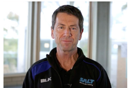
Bendigo Bank supports SALT – Sport and Life Training. If your sports club would benefit from a SALT workshop, contact us for help to cover the cost of the first session.