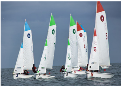
Daveys Bay Yacht Club had a great summer season of sailing. They hosted a number of events including an inter-schools teams racing competition and the GirlSail event.

Community Bank Mt Eliza – along with many other local supporters – provided some funding.