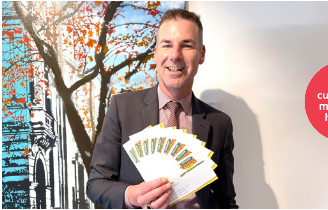
We continue to give a local stimulus boost to Mt Eliza retailers