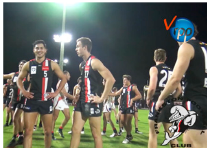
We're loving RPP's coverage of VFL football live from Skybus stadium. Tune in on 98.7 or 98.3FM or via their broadcast app and social media.