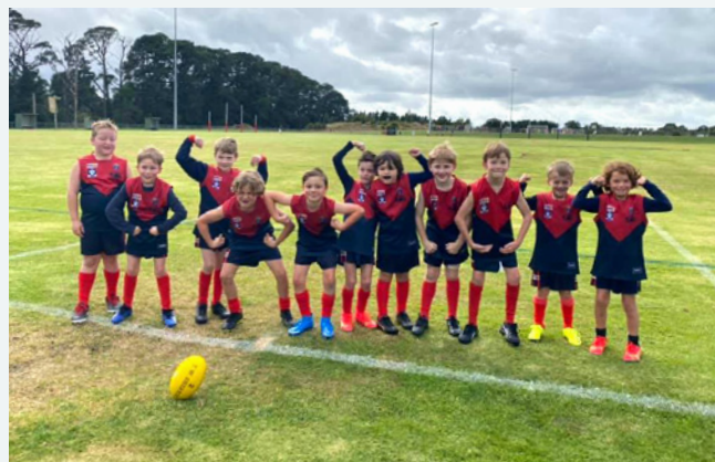
It was great to see the Redlegs junior players back on the field in April.