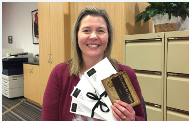
We're giving a local stimulus boost to Mt Eliza retailers