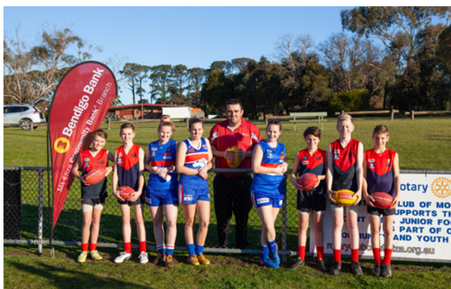
We're here to support our community groups, clubs, schools and initiatives through the COVID-19 pandemic

This survey highlighted for us that it has never been more important for Bendigo Bank's Community Bank branches to be supporting communities. Thank you to the many local people we spoke to as part of the process, your input was invaluable.