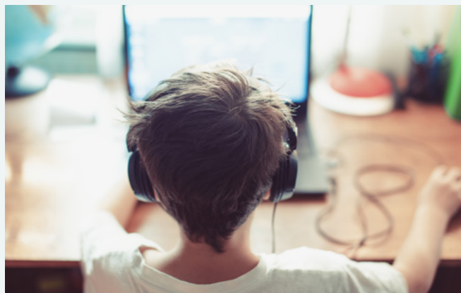
Getting local students the Internet access they needed for home learning

In March we checked-in with Mt Eliza Secondary College. They reported some difficulty getting a handful of students established with home Internet access. So we engaged local IT company SolutionOne to source dongles (which were in high demand at the time), provide data plans and phone technical support to get the local students set-up quickly, with minimal disruption to their studies.