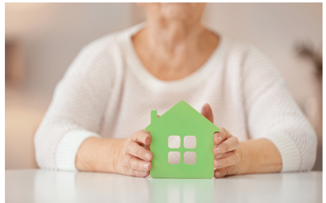
Housing relief payments to the tune of $10.1 million have been made to bushfire-affected people in Victoria

"These bushfire-affected communities are also now facing the compounding impact of COVID-19, so it's more important than ever that we stand alongside them for the long term – something Bendigo Bank has done for more than 160 years," she said.