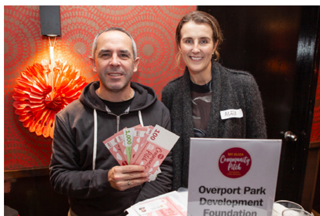
Our customers contributed to the new infrastructure at Overport Park