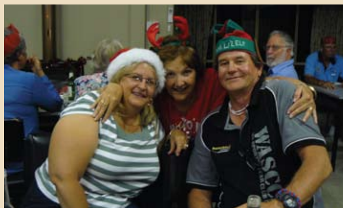
Community Connect Christmas Dinner.

The shareholder dividend for 2014/15 was paid to our shareholders in December. Dividends were 12 cents per share, a total of $67,844. This brings the total returned to shareholders to $608,127 over 12 years.