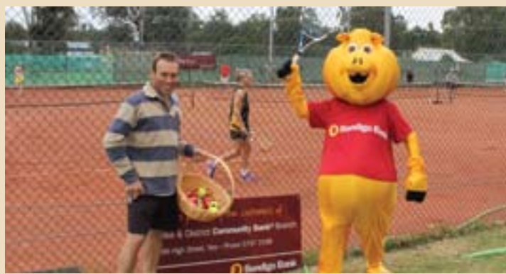
Left: Alexandra Spring Fair.