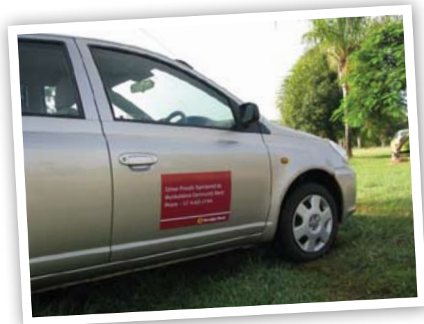
▲ QLD Health / Jena Boran Volunteer Driver Program.