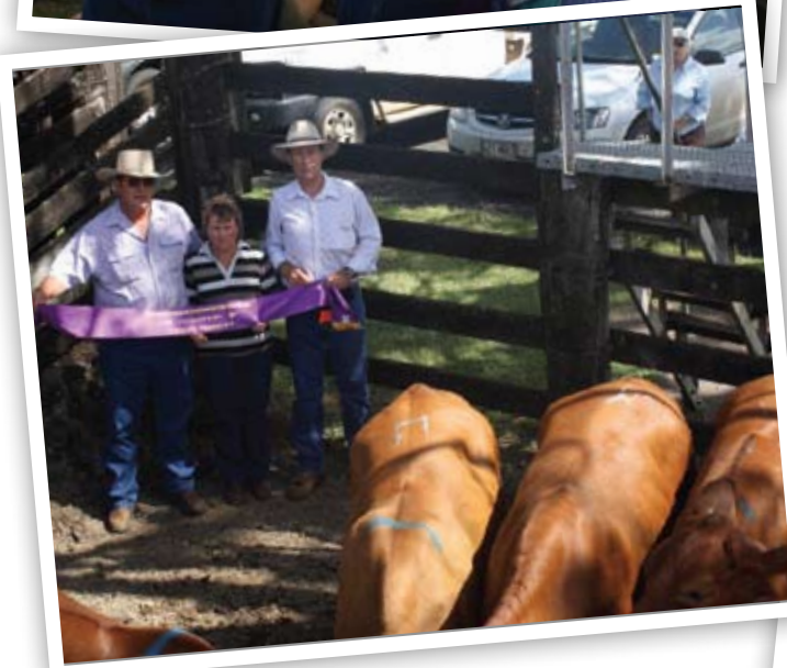
Droughtmaster Cattle Show and Sale Major Sponsor.