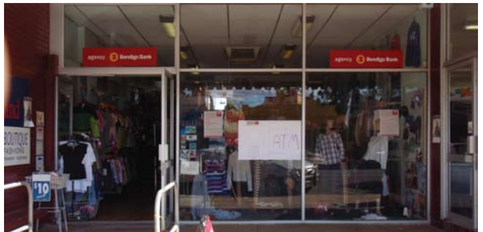
▲ Major milestone for 2009 opening of Gayndah Agency & ATM at Mensland.

By developing a profitable business that supports the local community, we have been able to give more than $15,000 to local community organisations, projects and a wide range of activities.