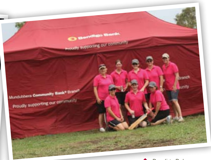
▲ Bendigo Babes 7-A-Side-Cricket team.