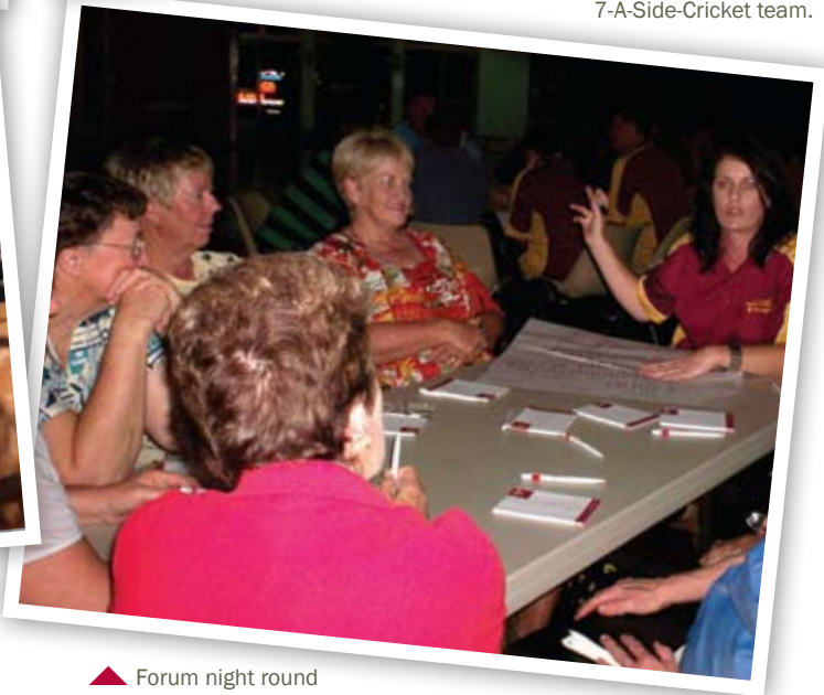
▲ Forum night round table discussion.