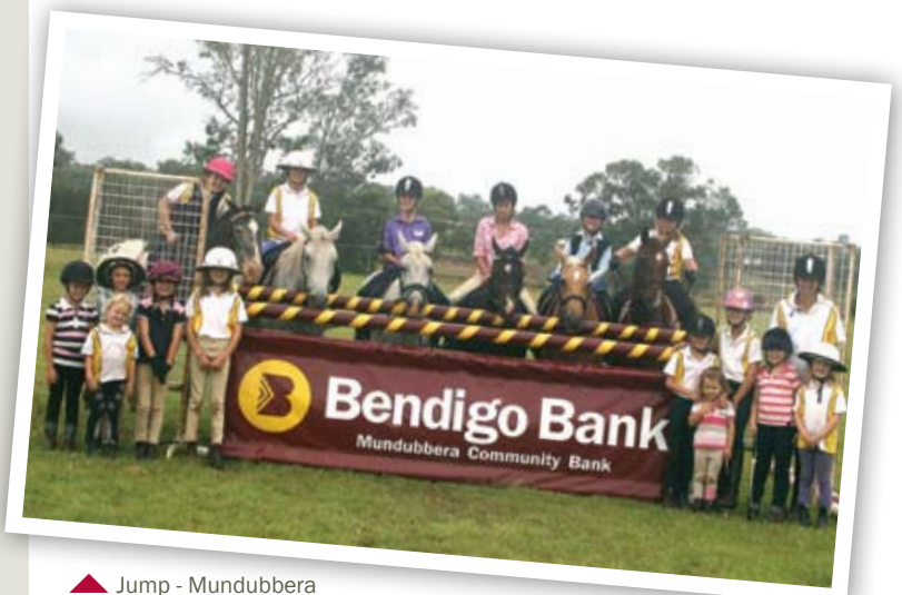
▲ Jump - Mundubbera Horse & Pony Club.