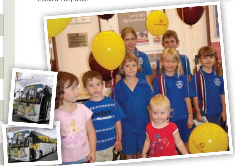
▲ Bats N Bulls Street Parade Festival.