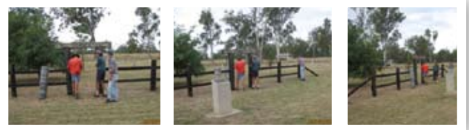
▲ Contributed to the erection of a fence at Olympic Park - Mundubbera Lions Club.