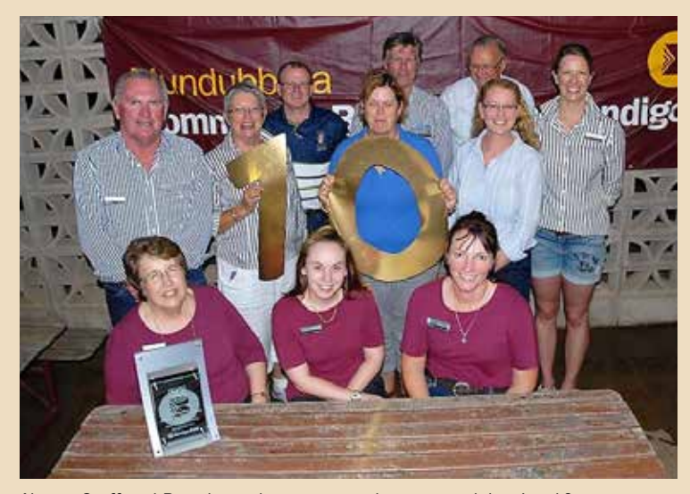
Above: Staff and Board members, past and present celebrating 10 years at the Annual General Meeting in November.