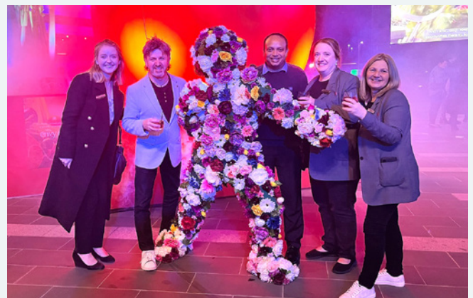
Above: Some of our team at Casey Cornucopia in July.