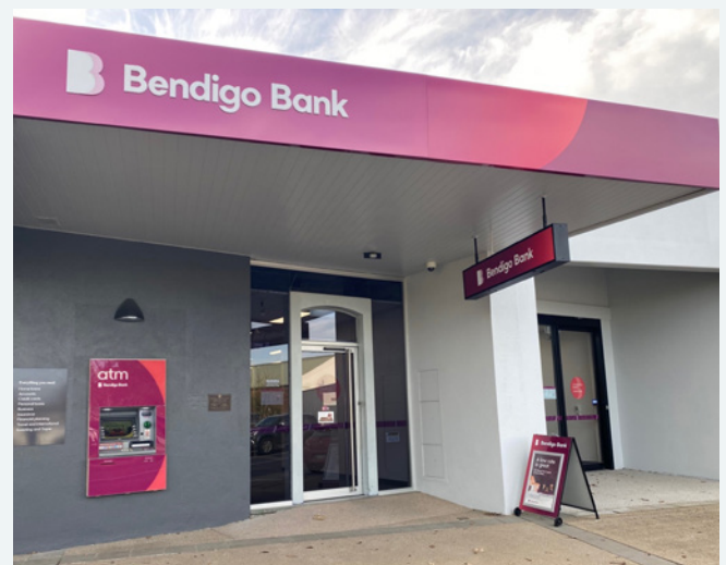
Above: The new look Lang Lang branch is looking great.

We've prepared some tips so you don't get caught out. Pop in and speak to us, or visit the Bendigo Bank website for more information: https://bit.ly/3CRW4li