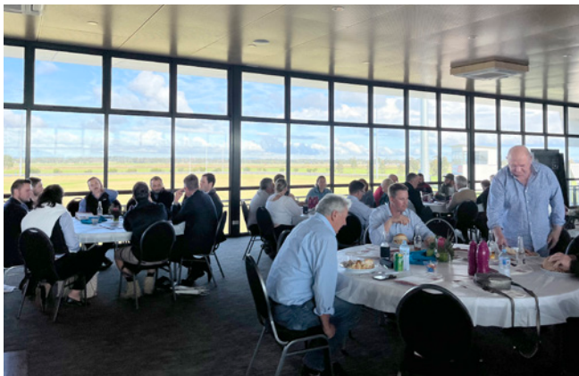
Above: Local community members enjoying our farmers' luncheon

We thank all those who attended and look forward to making this an annual event in our calendar.