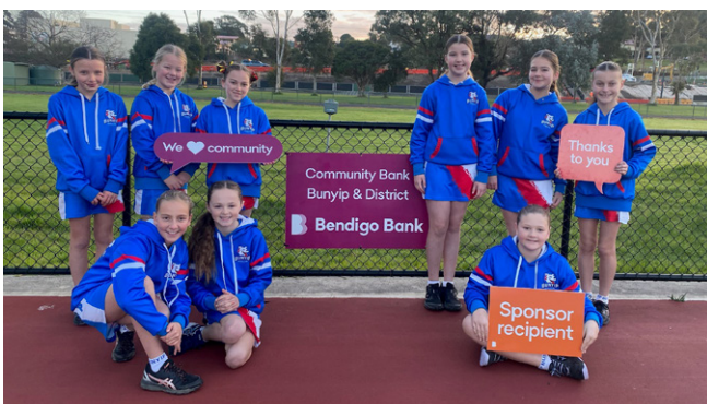
Bunyip Football Netball Club's U11 netball girls.

Community Bank Bunyip are proud to be sponsors for Bunyip Football Netball Club for their 2023 season.