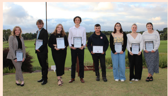
Our 2023 scholarship recipients.

Applications close Monday 29 January 2024.