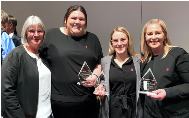
Congratulations to our award-winning teams from Lang Lang (above) and Koo Wee Rup (below).

Congratulations to our exceptional team at Lang Lang who took out the following three awards for the Melbourne–South East region at Bendigo Bank's recent regional awards night: Branch of the year, Operational excellence and General insurance. We also congratulate our Koo Wee Rup team who won the award for Wealth in the Melbourne–South East region. These awards are an acknowledgment of the passion, hard work and dedication our teams put in every day to serve our customers and community.