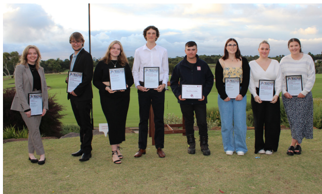
Congratulations to our 2023 scholarship recipients.

Since 2012 we have supported 63 students with a total investment of $567,000 across our five branches through our Community Bank scholarship program. We look forward to supporting students from the Bunyip area in our 2024 program.