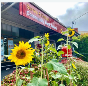
Community Bank Bunyip branch is now part of our company.