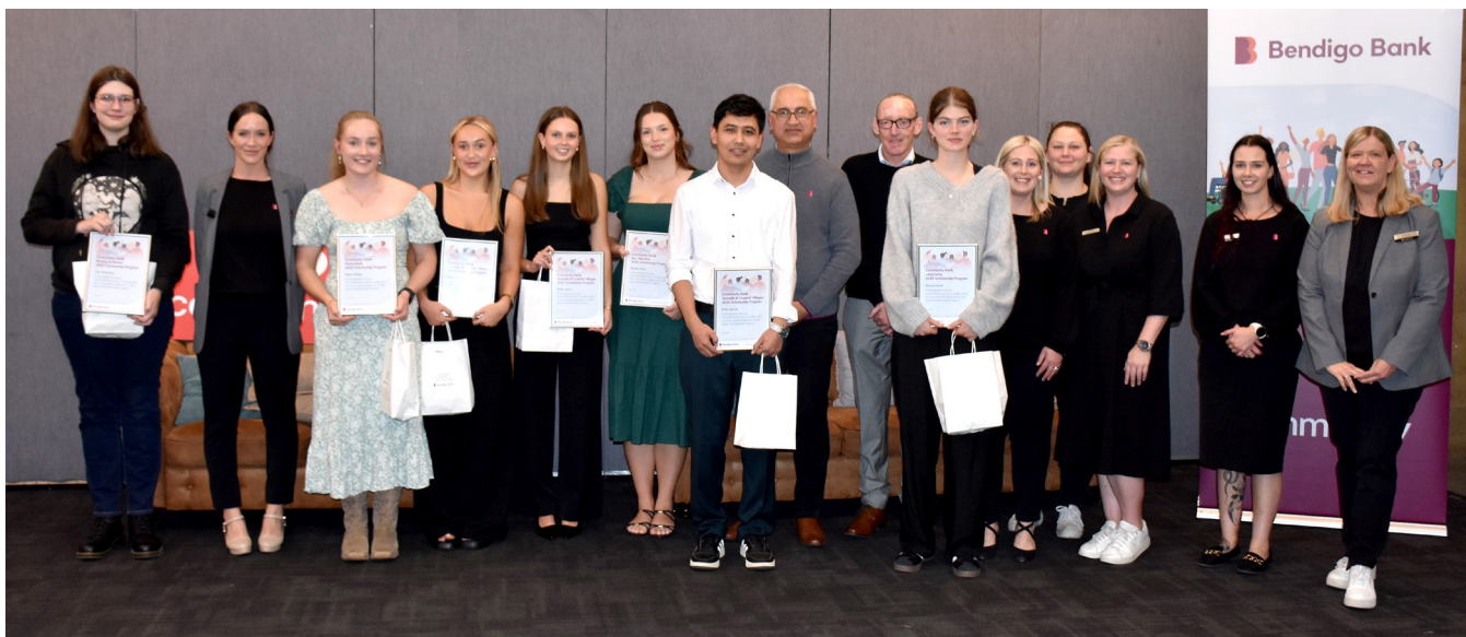
Above: Some of the 2025 Scholarship recipients with our branch staff.