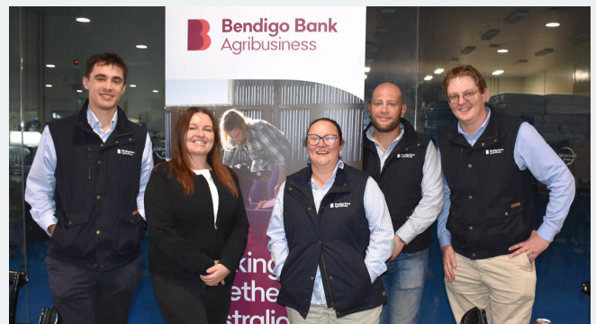
Above: Our annual Farmers' Luncheon was an opportunity for our agricultural community members to connect and engage. Top: Our 2025 Scholarship recipients, their families, our staff and directors at the scholarship presentation evening.