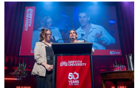
Celebrating 50 years of Griffith University.