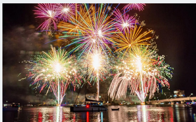
A spectacular start to the year at Paradise Point..