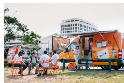
Orange Sky services for the homeless.

Put your money where your heart is and bank with us. We reinvest our profits to benefit the Gold Coast community.