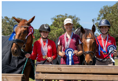
At the Southport Pony and Hack Club.

Our team had a great time at the recent Hong Kong Australia Business Association (Queensland Chapter) Business Awards Gala in late 2025. The glittering event recognised excellence across the business community, bringing together industry leaders, entrepreneurs and partners. We were proud to be a part of it.