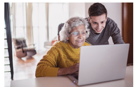
We're keeping our customers safe online.

Scams cost Australian consumers, businesses and the economy hundreds of millions of dollars each year. Bendigo Bank's website has information on how to spot the latest scams, keep your identity safe, and protect yourself. Visit: bendigobank.com.au/security