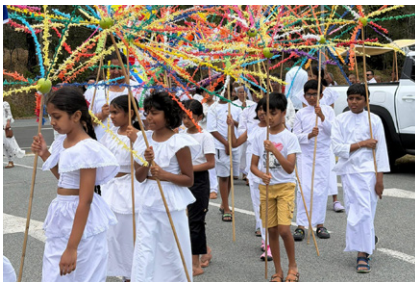
Children leading a ceremony at the Gold Coast Buddhist Centre.

We're delighted to be supporting a number of community cultural groups here on the Gold Coast, including the Sri Lankans' Association and the Gold Coast Buddhist Association.