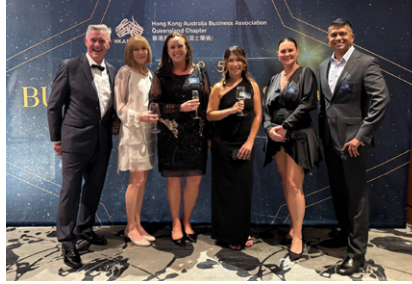
The Business Awards Gala in November.

The Meeting Place: Oxenford/Coomera Community Youth Centre's Community Care Program supports local families and people. We're right behind them, providing funding for the program. It helped deliver free food boxes, counselling sessions and emergency relief to families here on the Northern Gold Coast over the past 12 months.