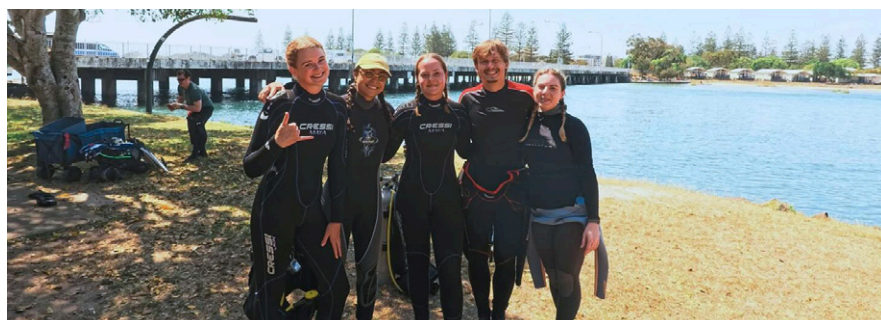
Connecting the community to the wonders of our local marine environment.

Ocean Connect is a group of volunteer marine biologists working to inspire everyone to learn about the marine environment. We're proud to support their marine citizen science and education programs here on the Gold Coast.