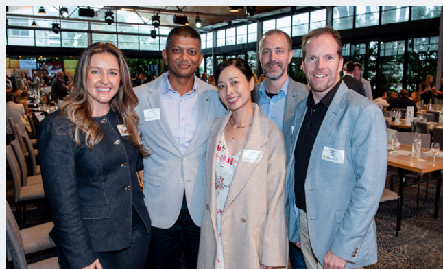
Some of our team with guests at the Entrepreneur's Forum.

Thank you to the team at YP Gold Coast and everyone who attended. Learn more at: ypgc.com.au