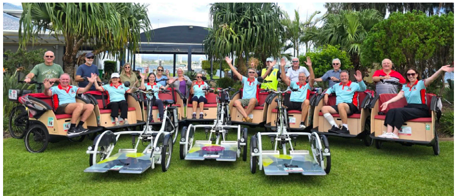
Some of the volunteers from Cycling Without Age Gold Coast.