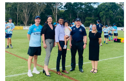
Our team visited a Leagueability training session recently to meet some of the players.

titans.com.au/community/inclusion/leagueability