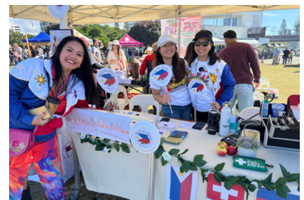
Fun at the festival.

We love being part of such a vibrant, multicultural community.