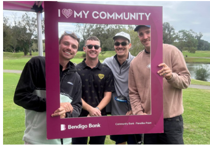
Hitting the greens at Royal Pines Resort.

Bendigo Bank delivers the products, technology and security you'd expect from a big bank, plus the personal service you wouldn't. If you're with another bank, moving over to Bendigo Bank isn't as hard as you might think, and we're here to help. See our contact details on the back page.