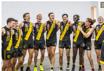
In the locker room with the Labrador Tigers.

We are proud to be a platinum partner of the Labrador Football Club. In early June the club held their charity golf day at RACV Royal Pines Resort. Thanks to everyone who came along for the fun. It was great to connect with the club's members and supporters on the day. We wish the Tigers all the best for the rest of the 2025 AFL season.