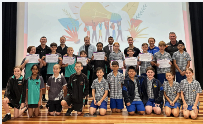
Local students participating in the BOP Future Leaders Program.

In May, we attended the program's presentation day, where students gave their creative pitches to solve community issues. With these impressive young minds on the job, the future of our community looks bright.