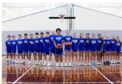
We're proud to support Gold Coast Basketball.

Our support of Gold Coast Basketball keeps local basketball fans and players fit, active and engaged. With levels from NBL1 all the way through to representative teams, juniors and all abilities, there's opportunities for everyone to get involved in local basketball. Learn more at: goldcoastbasketball.com.au