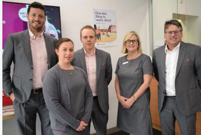
Community Bank Parkdale staff wearing their new uniforms.

As we move into the banking side, Bendigo Bank looks forward to its Spring Home Loan campaign and has brought out some exciting rates to match it. While in lockdown and going through some spring cleaning, it is a great time to meet with one of our specialists and see if we can help you out and most importantly save you some money. Unlike