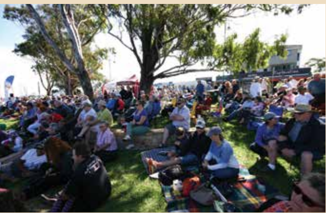
Top and above: A huge crowd made the most of the great weather at the Paynesville Music Festival.